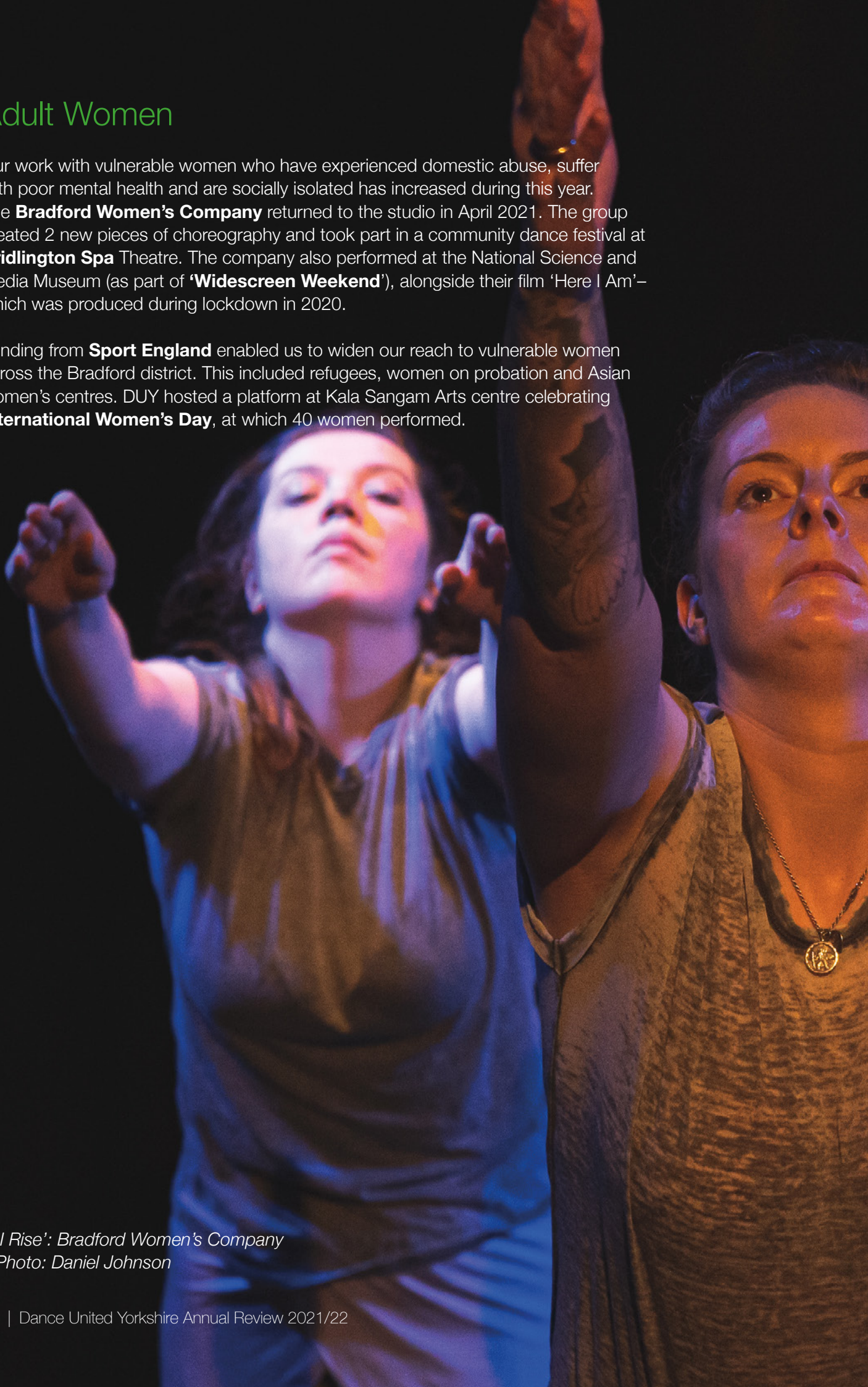
'I Rise': Bradford Women's Company

Funding from Sport England enabled us to widen our reach to vulnerable women across the Bradford district. This included refugees, women on probation and Asian women's centres. DUY hosted a platform at Kala Sangam Arts centre celebrating International Women's Day , at which 40 women performed.