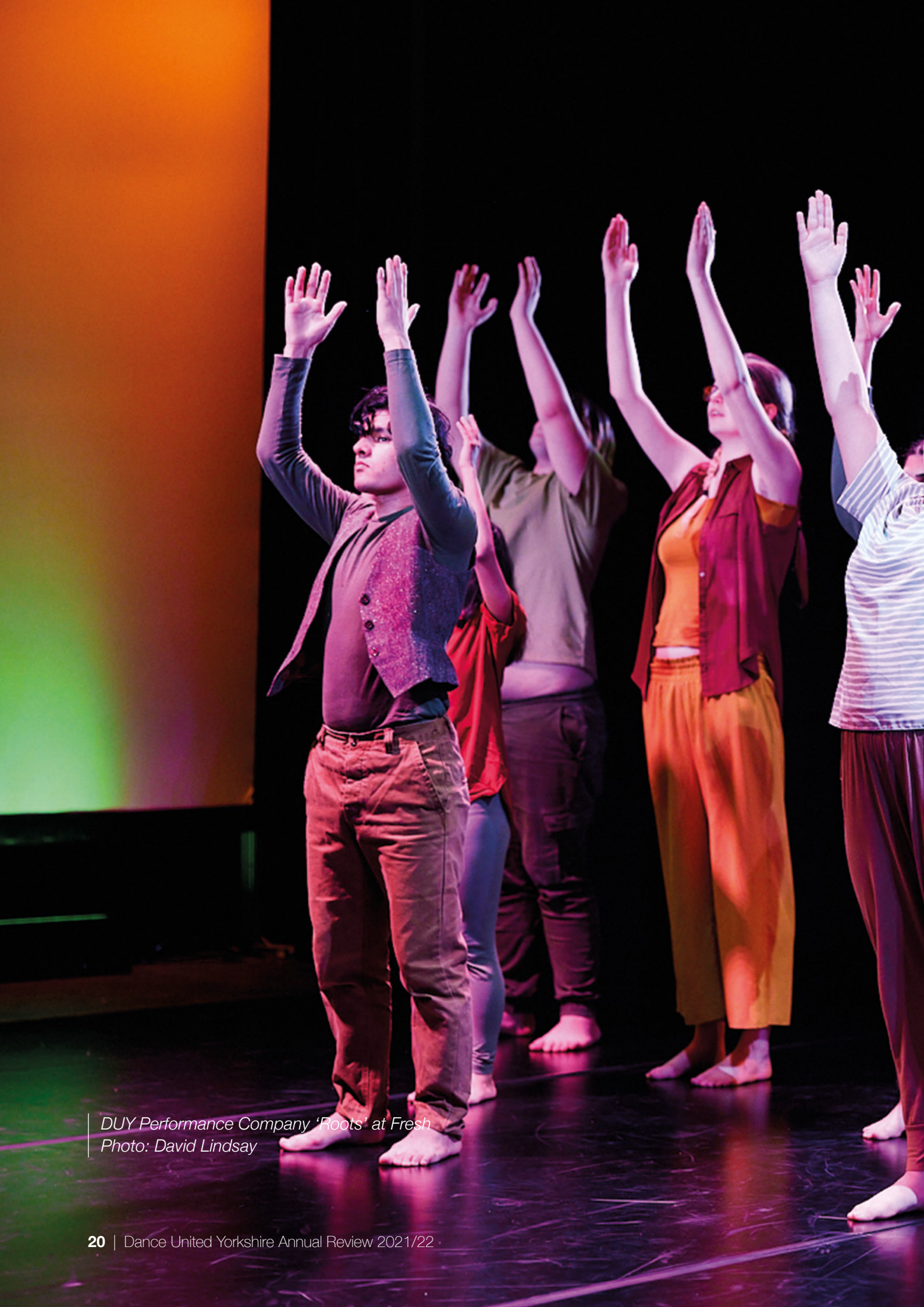
DUY Performance Company 'Roots' at Fresh