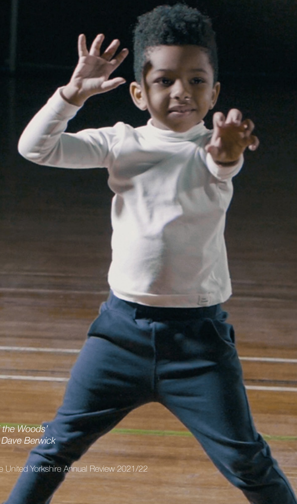
'Out of the Woods'

As government restrictions eased following the COVID-19 crisis, we returned to face-to-face delivery for all our weekly classes, workshops and intensive projects: