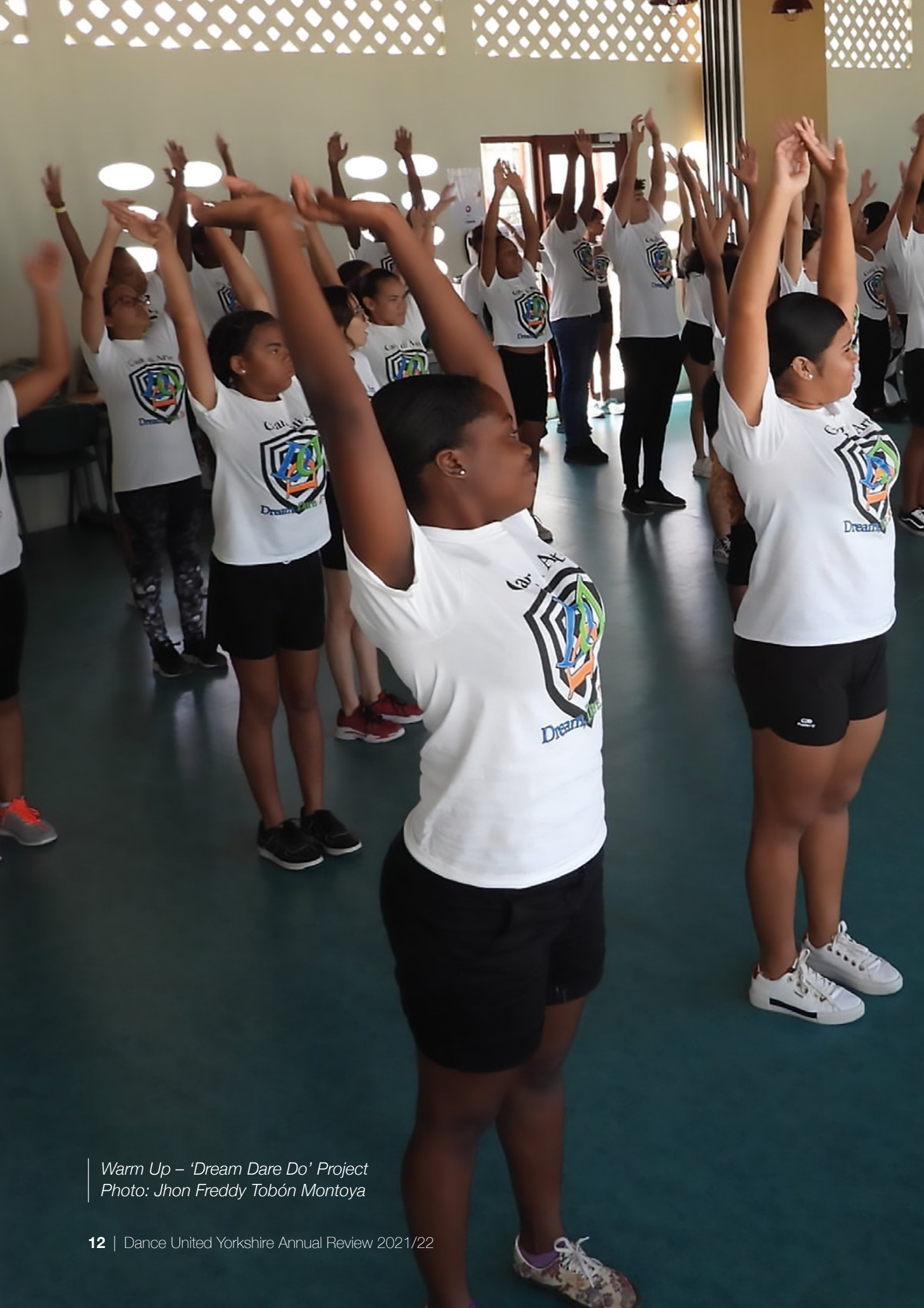
Warm Up – ‘Dream Dare Do’ Project