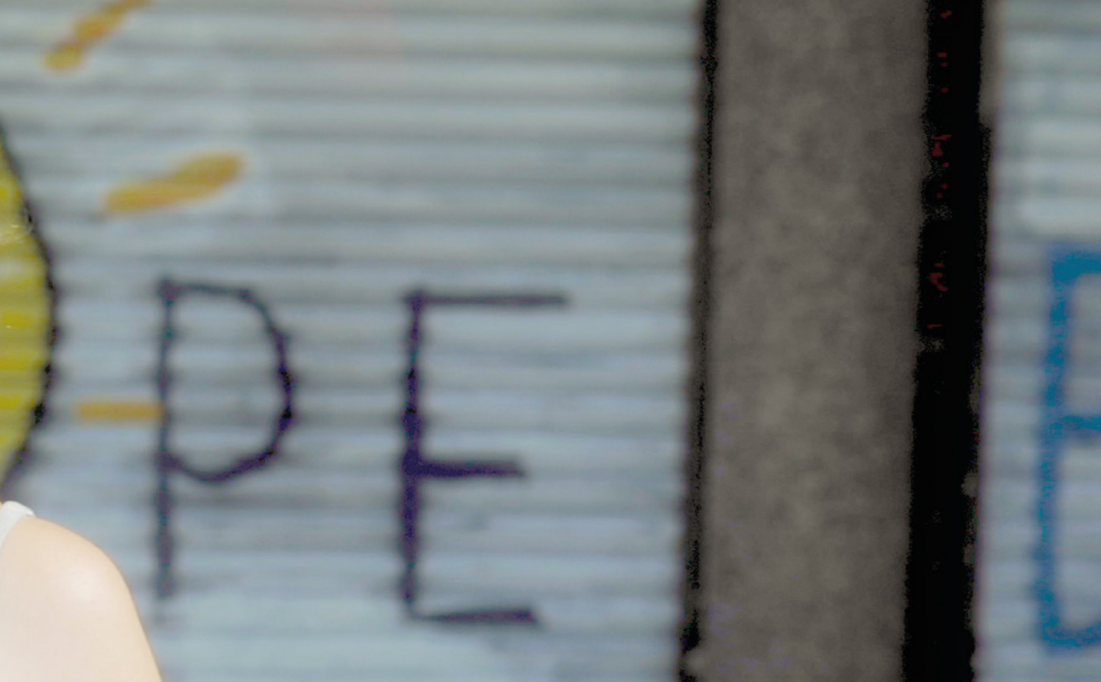
'Here I Am' – Bradford Women's Company Film