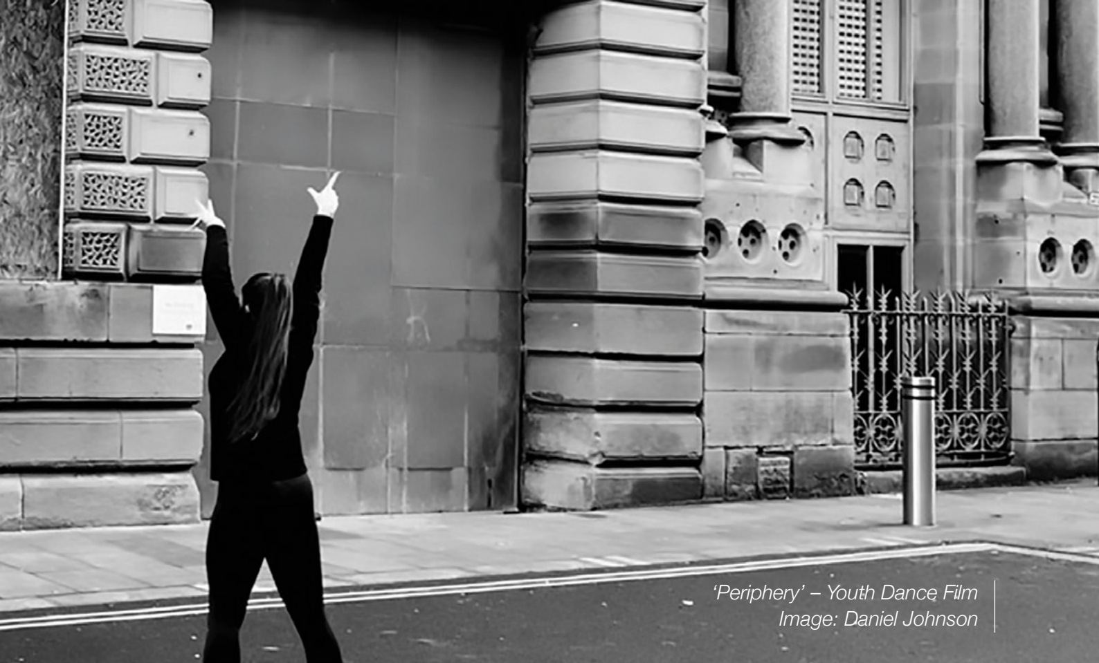
'Periphery' – Youth Dance Film

New Adventures has also invited three members of the DUY Performance Company to take part in their Cygnet School, a new year-long training programme for young people, particularly those with limited access to high quality arts provision.