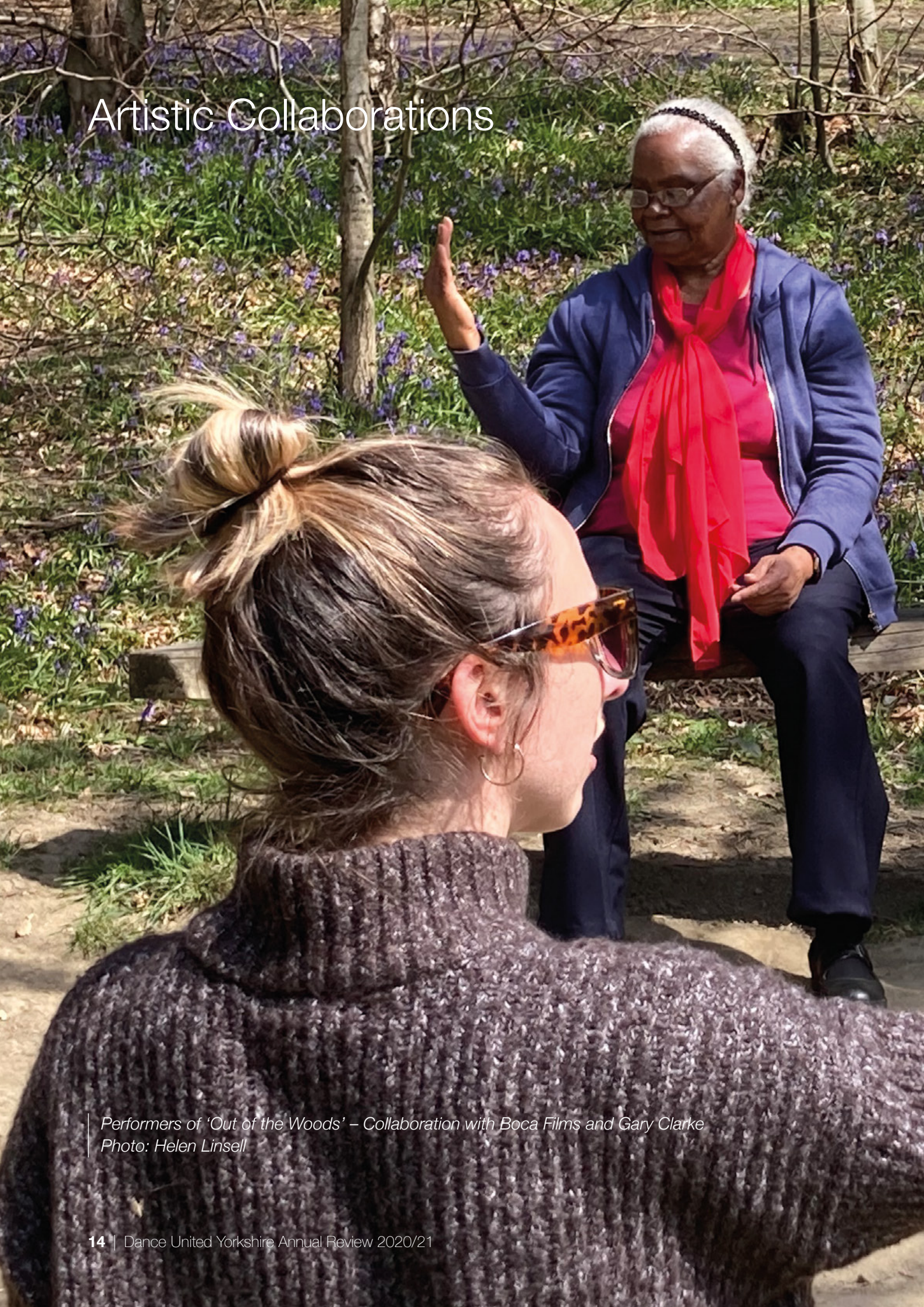
Performers of 'Out of the Woods' – Collaboration with Boca Films and Gary Clarke